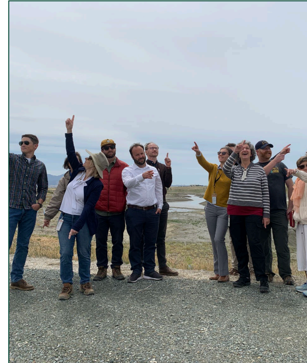
Sustainability Exchange tour of Lower Walnut Creek restoration project, May 2022.